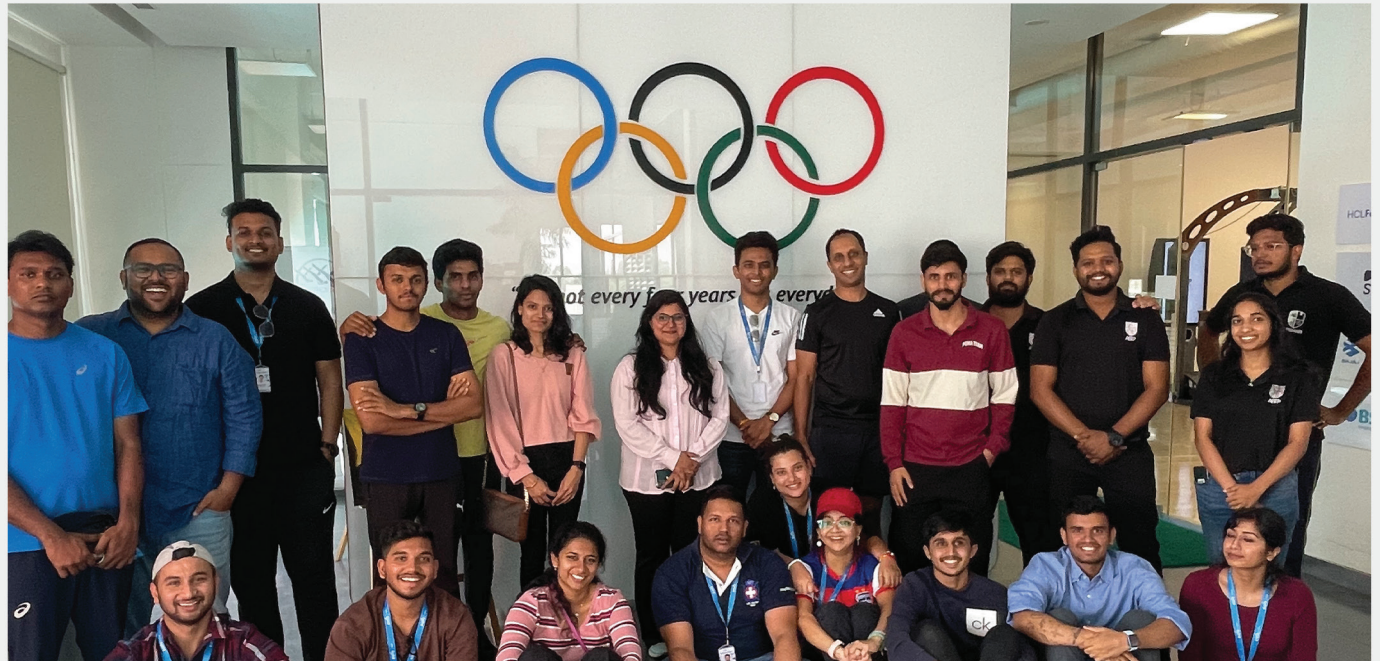
Padukone-Draavid Centre for Sports Excellence - Bengaluru