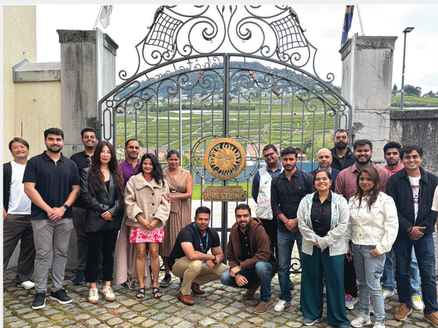
United World Wrestling - Lausanne