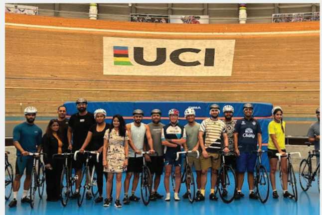
Union Cycliste Internationale (UCI) - Lausanne