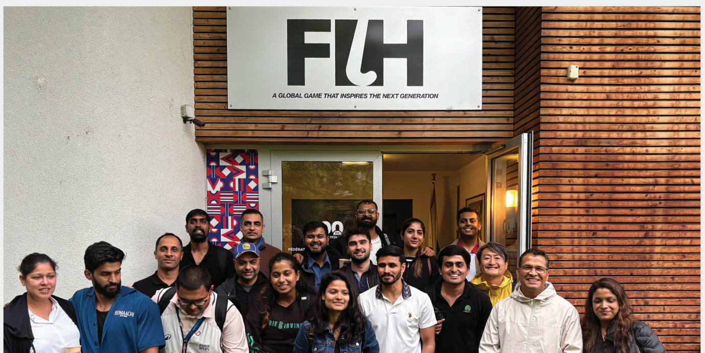
International Hockey Federation - Lausanne