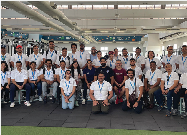
Inspire Institute of Sport - Bellary