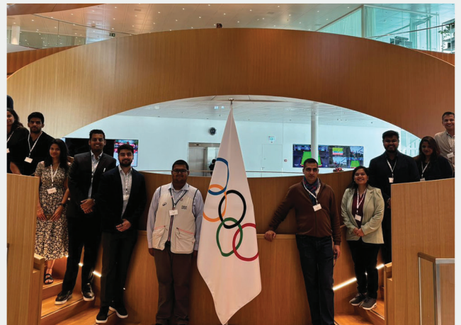
Olympic House - Lausanne