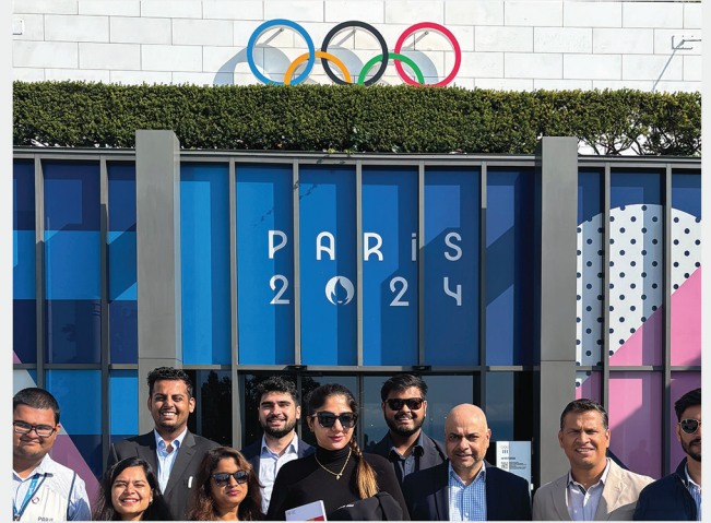
Olympic Museum - Lausanne