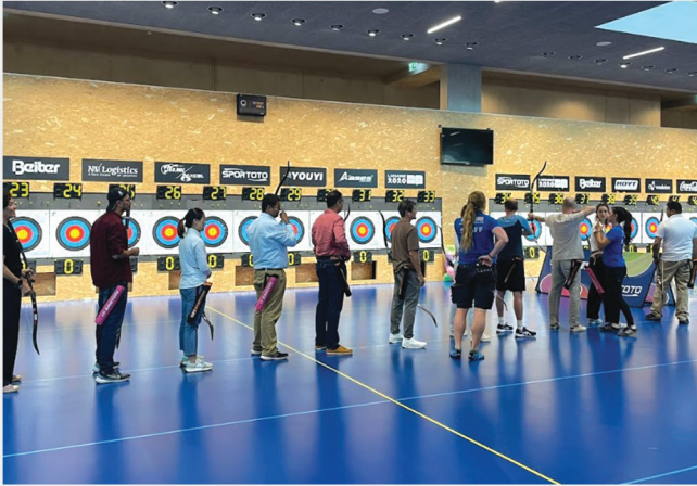
World Archery Excellence Centre - Lausanne